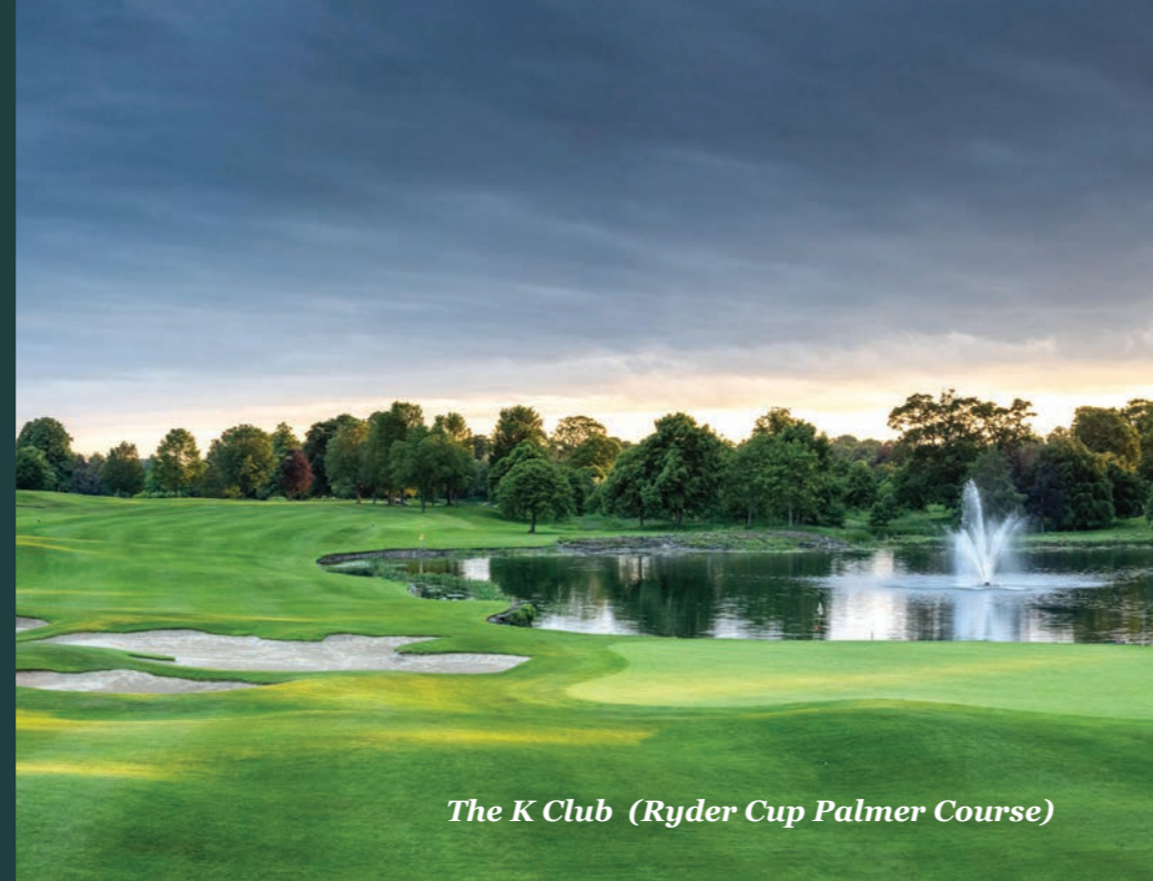
The K Club (Ryder Cup Palmer Course)

With ease of access through Dublin Airport, and a great selection of accommodation on offer from Guesthouses to Castles, it's easy to see why Dublin is so popular with first time visitors. And as with all our tours, we will ensure there's enough time to learn all about the history and culture of this beautiful area with visits to the National Stud, Powerscourt House & Gardens, Trinity College, Jameson Distillery, the Guinness Storehouse and many more attractions on offer!