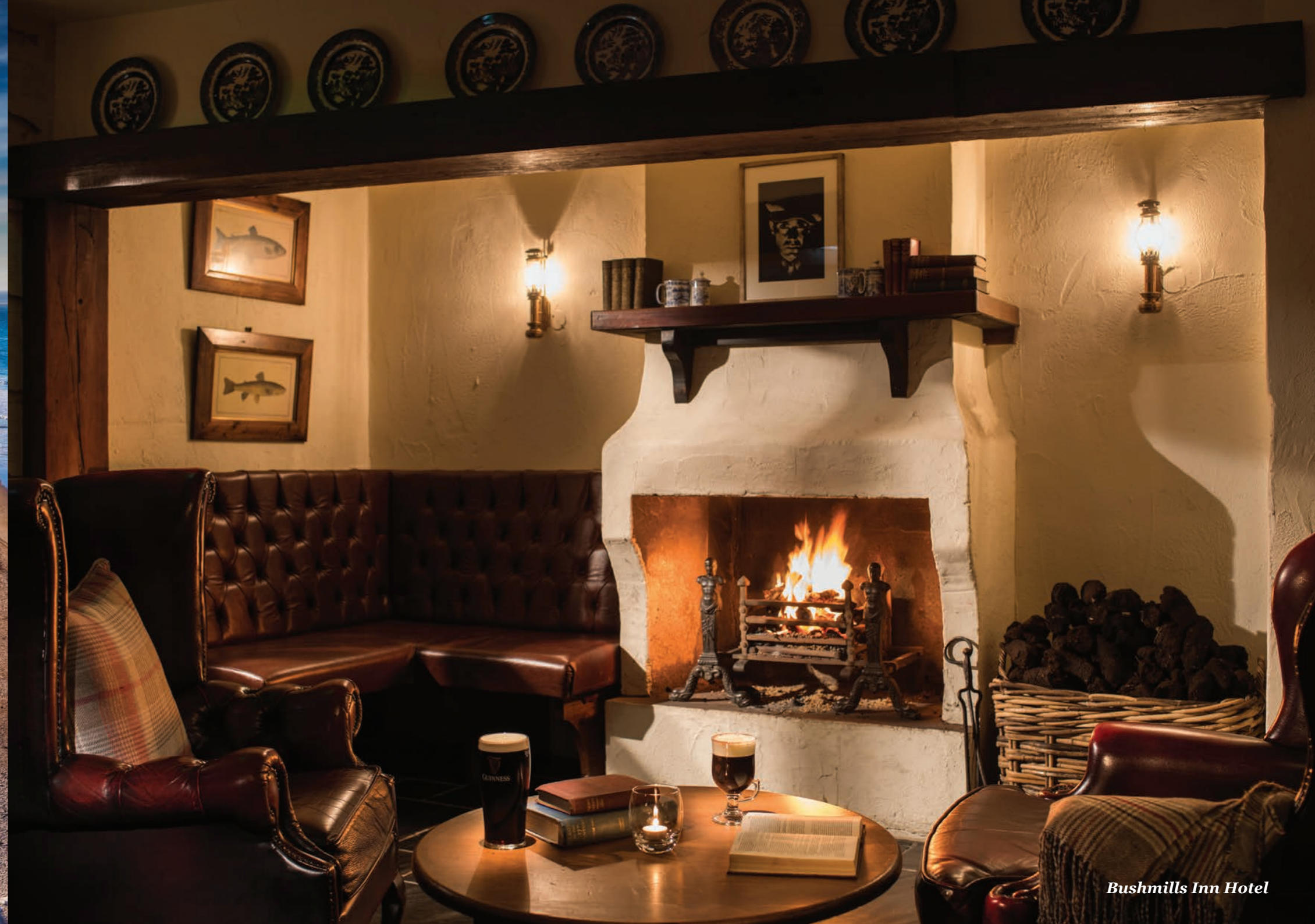
Bushmills Inn Hotel