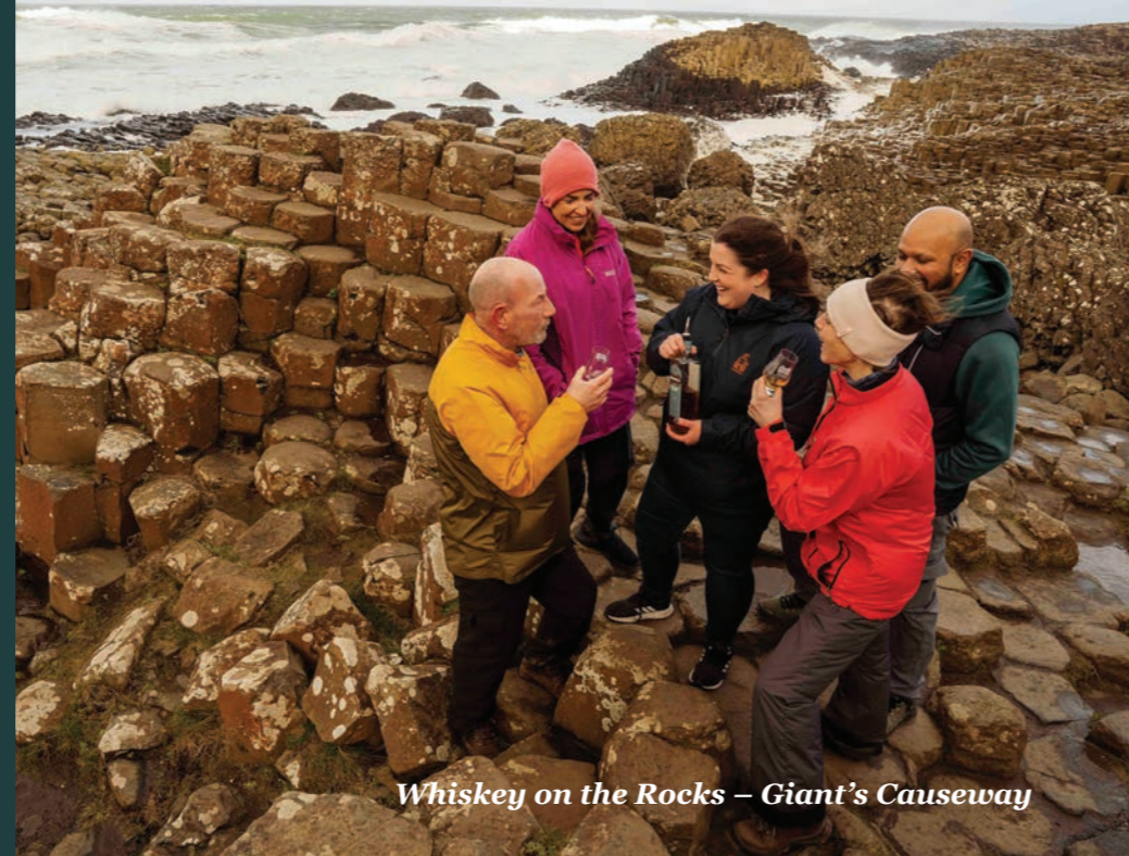
Whiskey on the Rocks – Giant's Causeway

As Royal Portrush looks forward to hosting The Open Championship again in 2025, why not walk in the footsteps of giants and discover for yourself what the stunning north coastline of Ireland has offer!