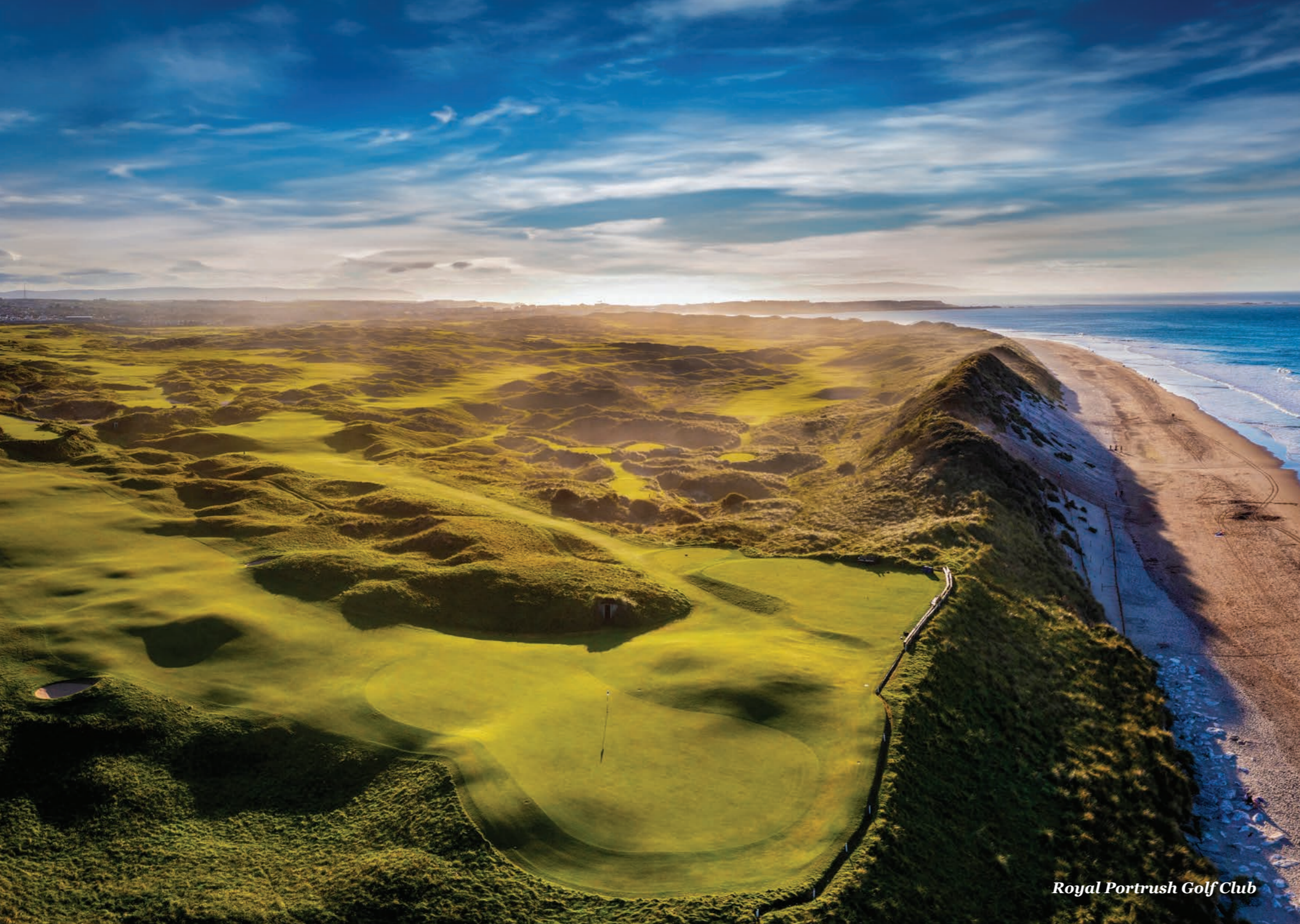
Royal Portrush Golf Club