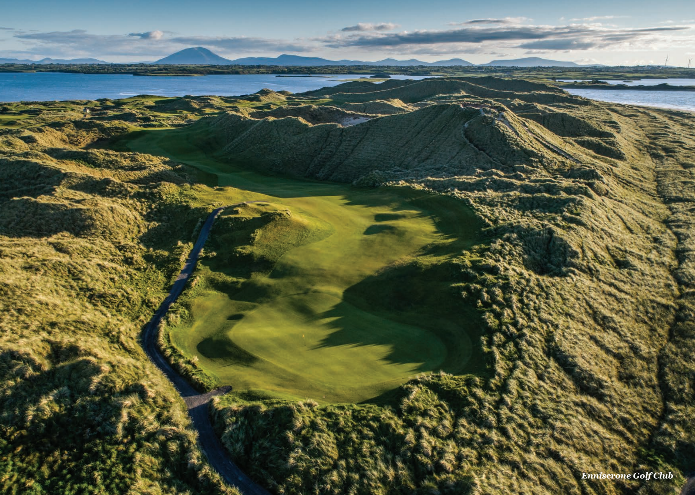
Enniscrone Golf Club