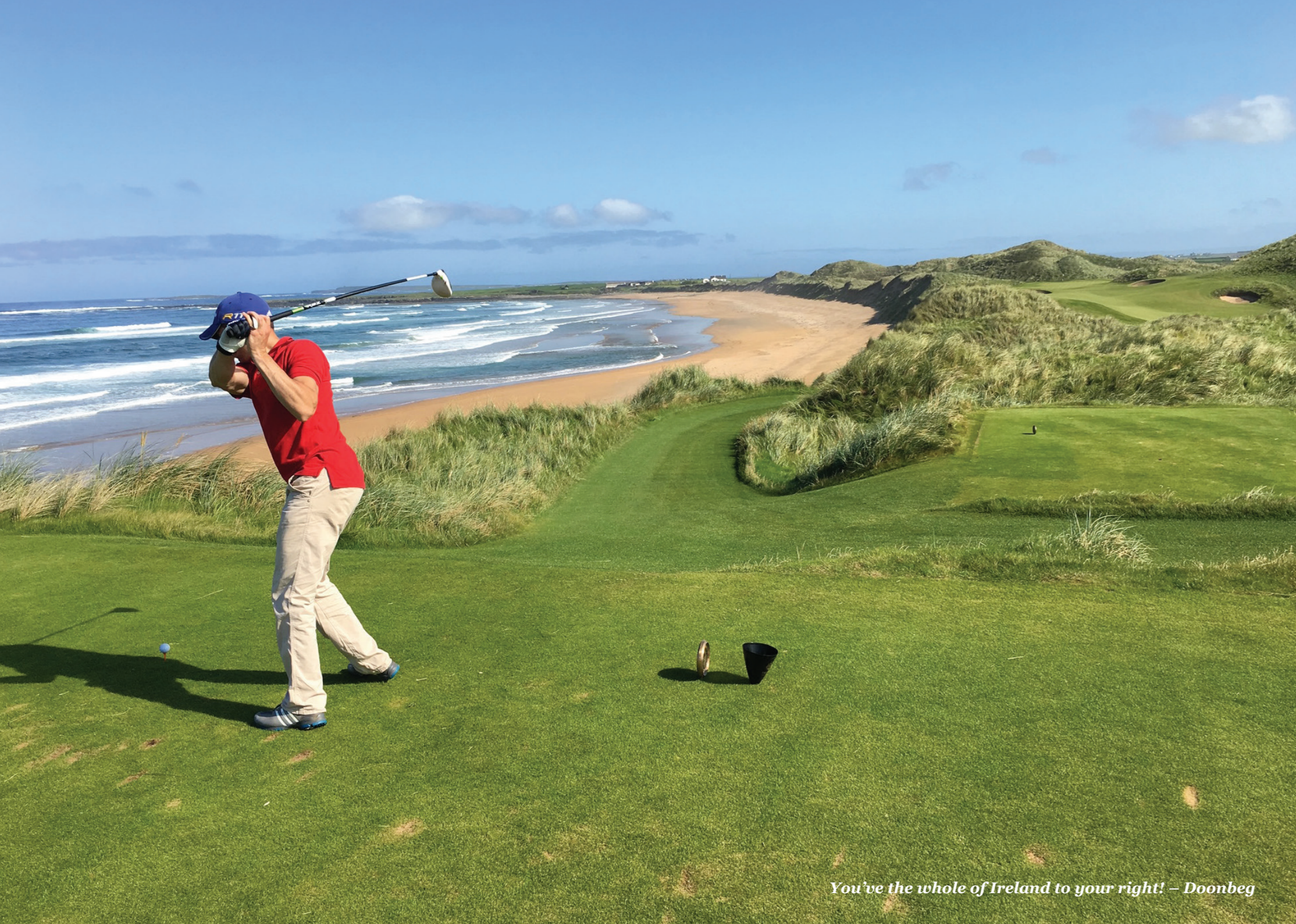
You've the whole of Ireland to your right! – Doonbeg