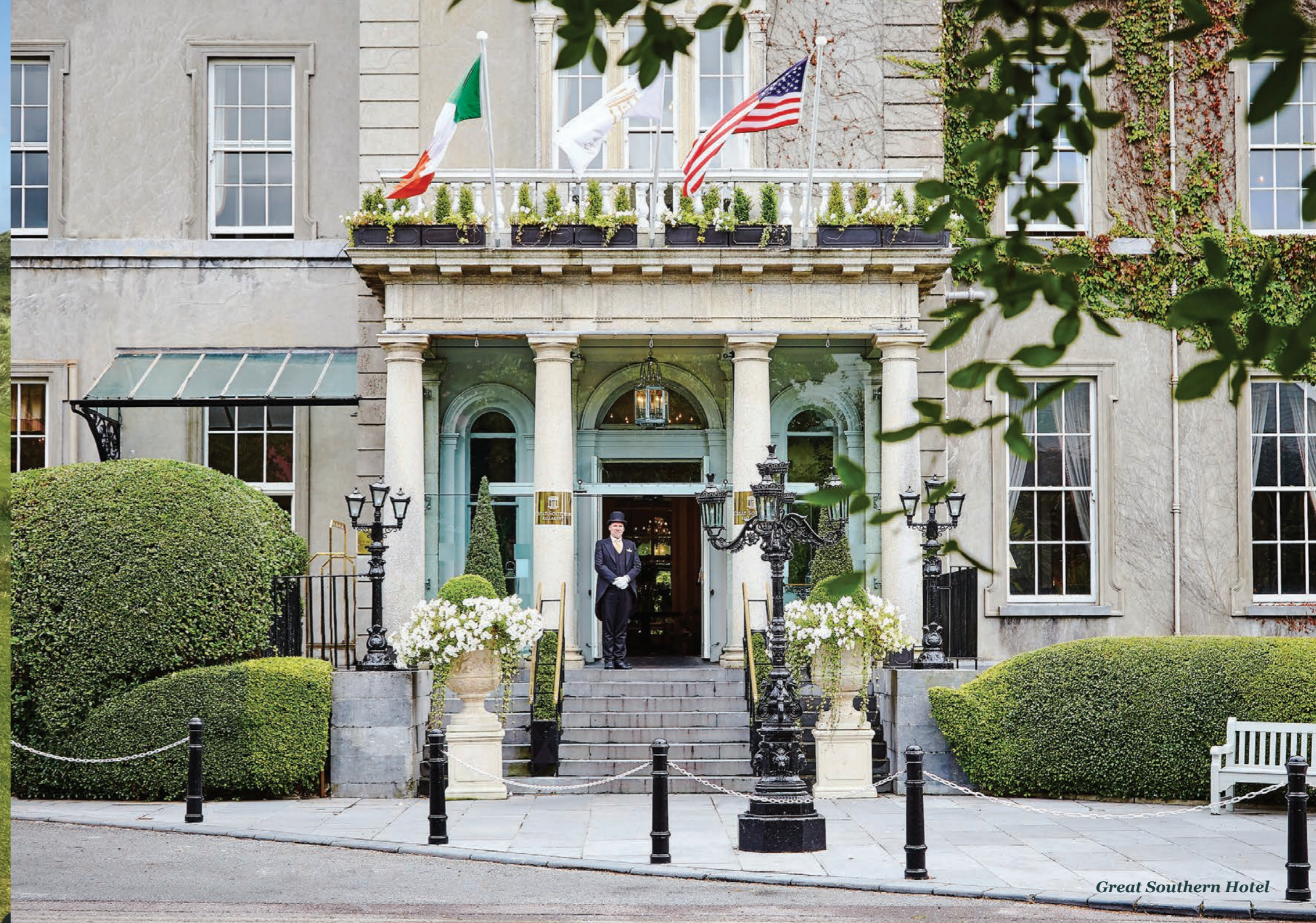
Great Southern Hotel