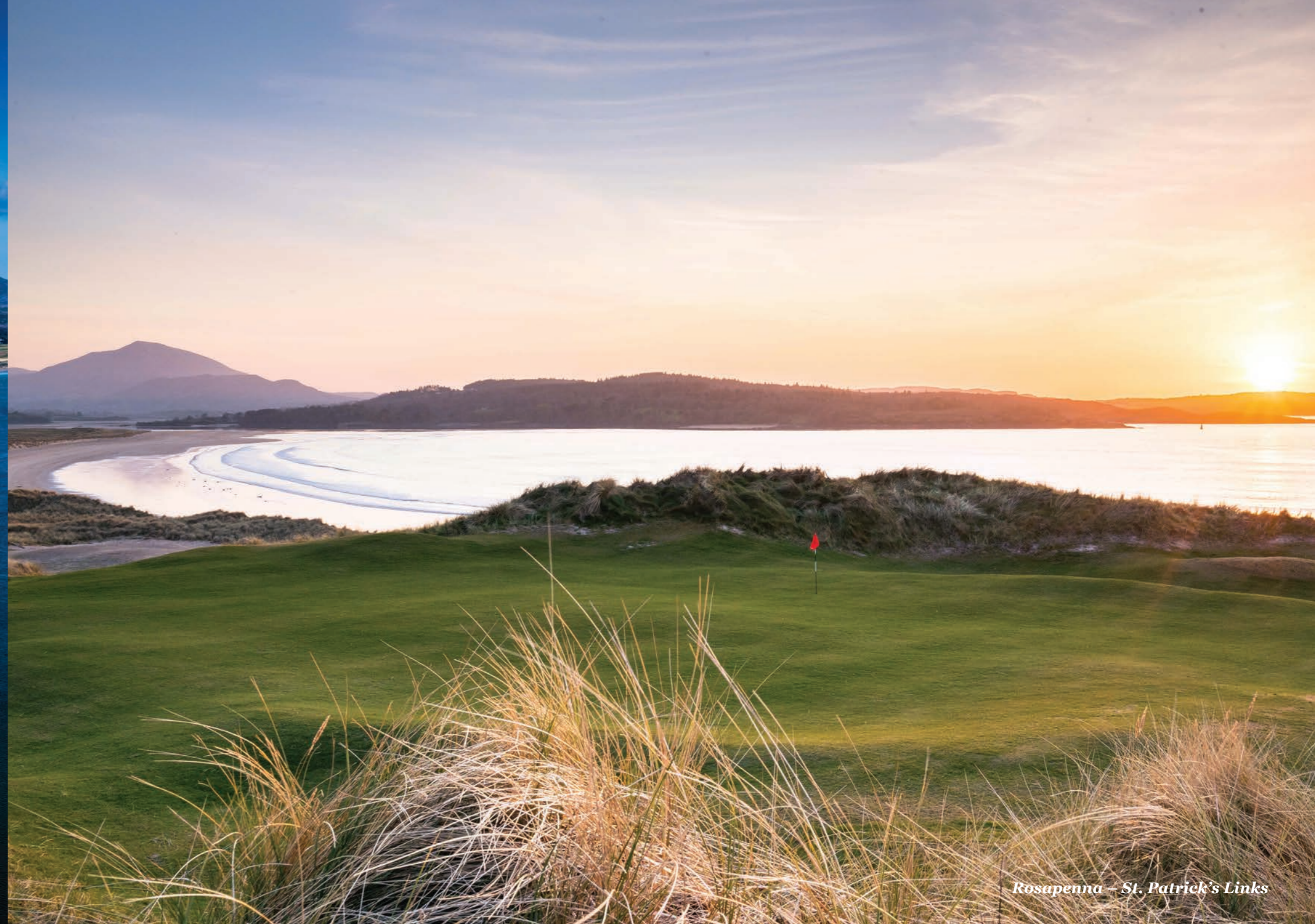
Rosapenna – St. Patrick's Links