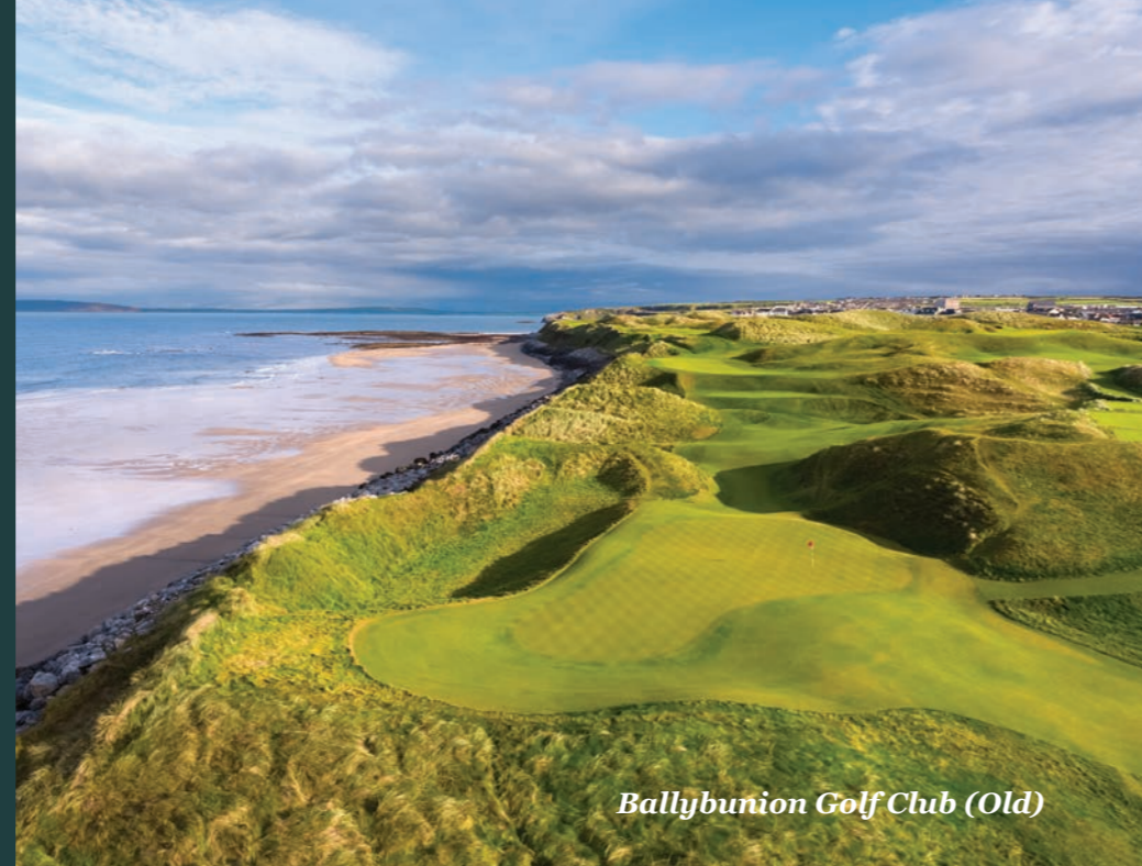
Ballybunion Golf Club (Old)

With so much golf on offer, one can be forgiven for not leaving some time to see the sights, but with some of the most magnificent sightseeing you will find anywhere in the world including the Dingle Peninsula, Ring of Kerry, Skellig Michael & Killarney National Park, you will quickly discover why this area is so popular with golfers and non-golfers alike. We'll make sure your tee times allow for both! Our Stunning South-West itinerary will see you stay in the bustling town of Killarney, in the centre of the action, with a superb selection of courses included. This tour is definitely one for that bucket list!