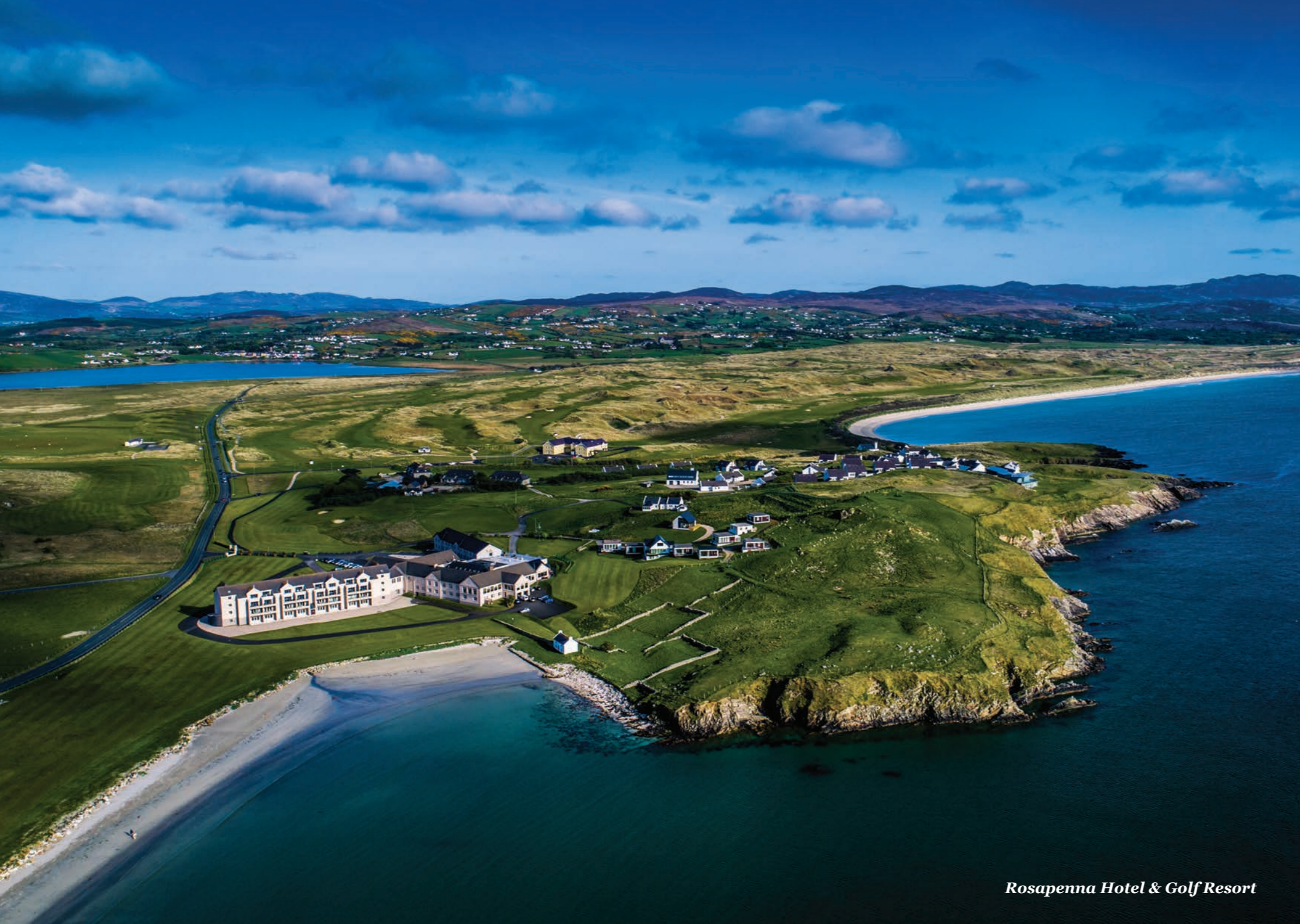
Rosapenna Hotel & Golf Resort