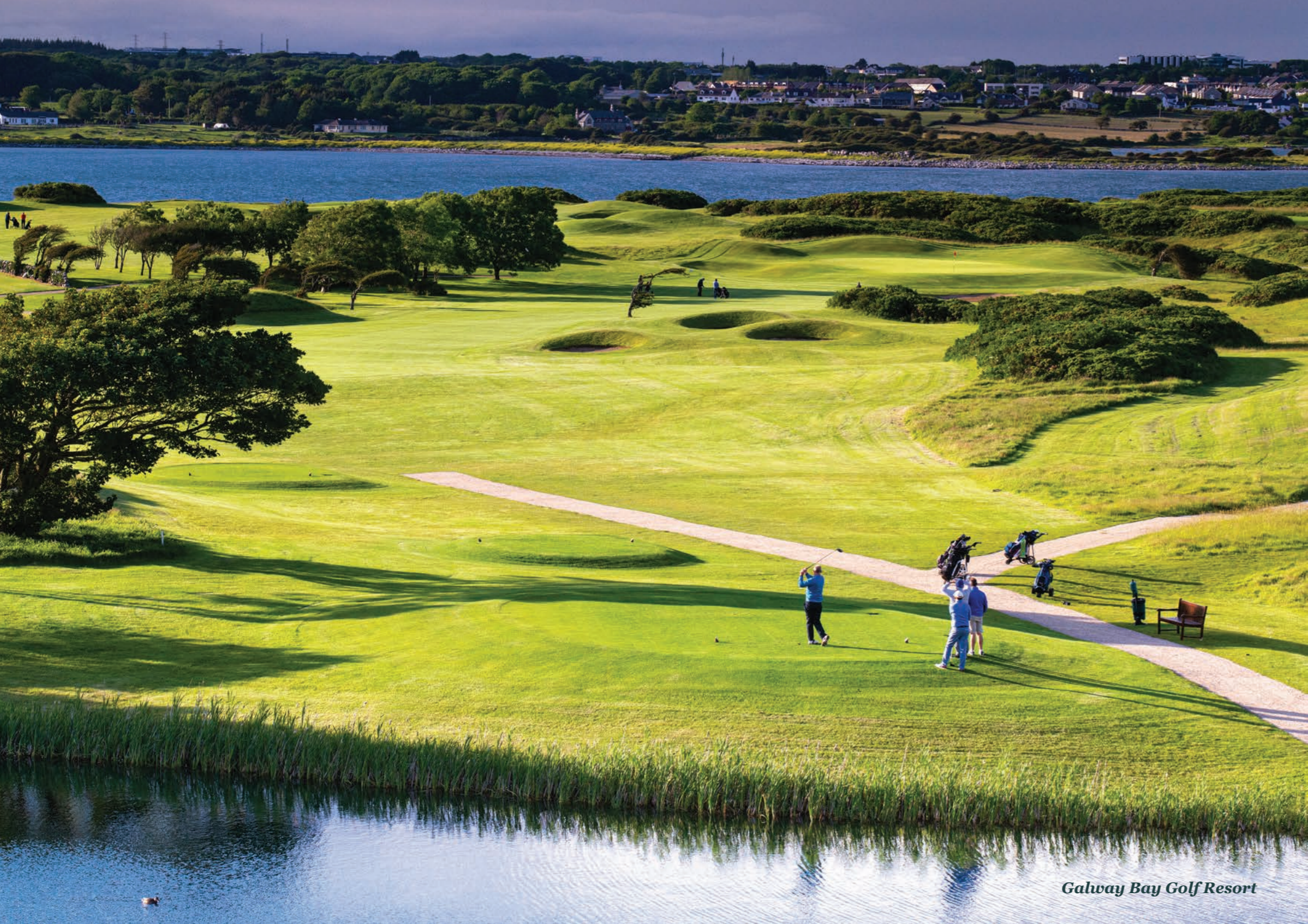
Galway Bay Golf Resort