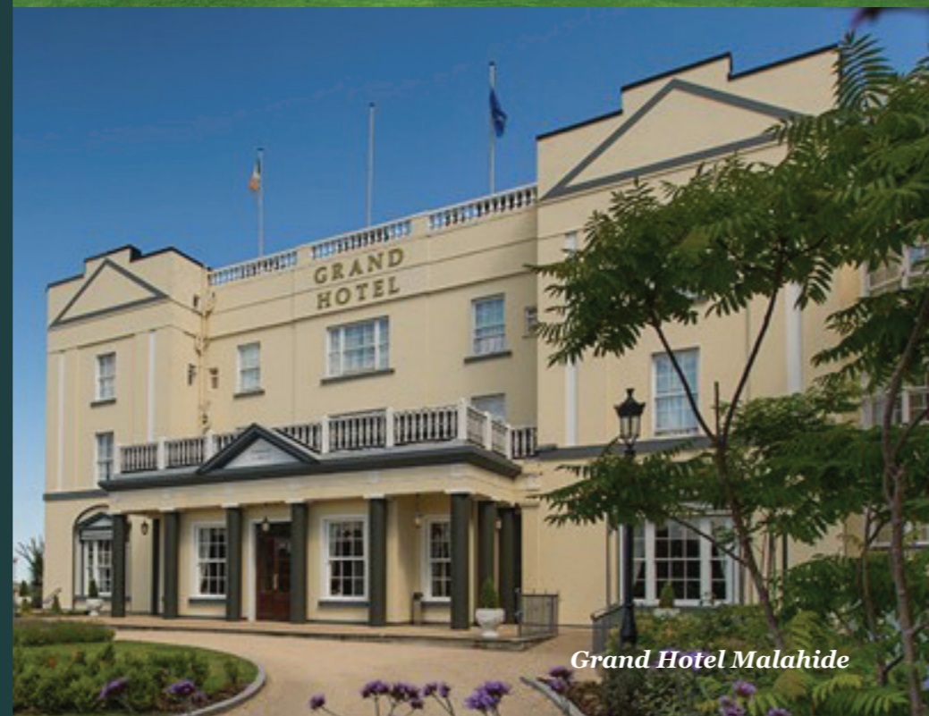
Grand Hotel Malahide