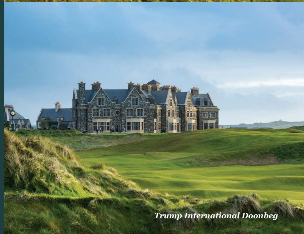
Trump International Doonbeg